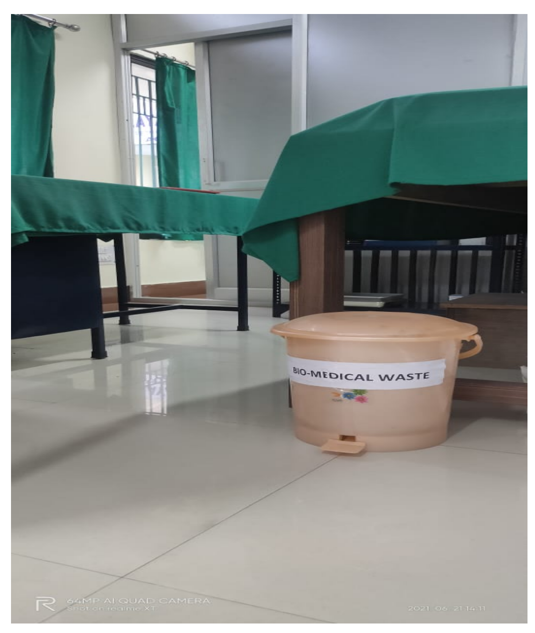
Waste Bin 1